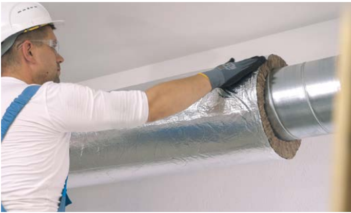
Circular air duct insulation