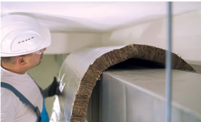
Rectangular air duct insulation