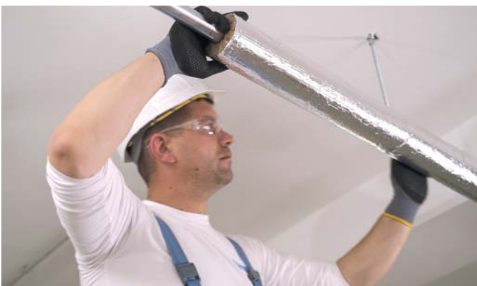
Insulation of pipe work